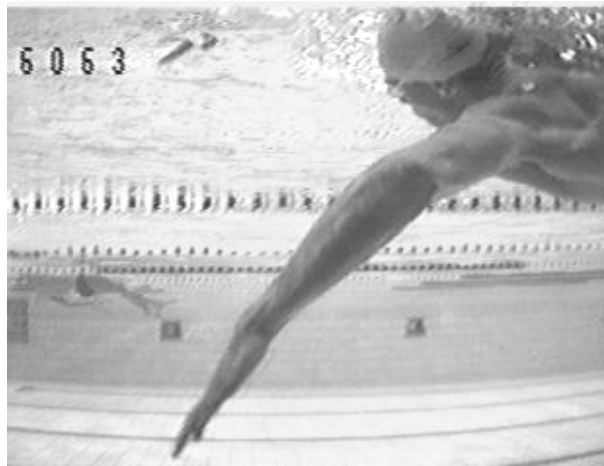
Figure 2. This picture is an example of sufficient quality for publishing and should be centered between margins. Remember that pictures will be printed in grayscale, not in color.